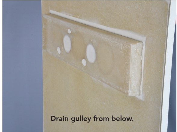
Linear shower base showing four gradients and three outlet locations in drain gully.